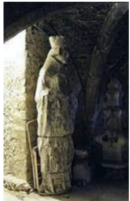
Statue of St Swithun the crypt of Winchester Cathedral

Swithun was initially buried out of doors, rather than in his cathedral, apparently at his own request. William of Malmesbury recorded that the bishop left instructions that his body should be buried outside the church, where it might be subject to the feet of passers-by and to the raindrops pouring from on high], which has been taken as indicating that the legend was already well known in the 12th century.