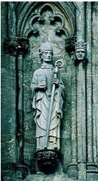
Statue of Saint Swithun in Stavanger Cathedral by Stinius Fredriksen, 1962