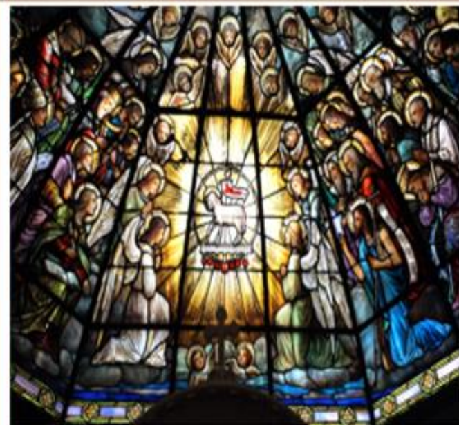
Wednesday 1st November 2023 All Saints Day