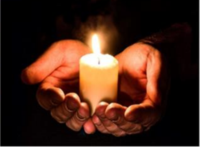
2<sup>nd</sup> November 2023 Thursday 7.30pm All Souls Day Requiem Mass

Worship is followed by drinks in the Atrium