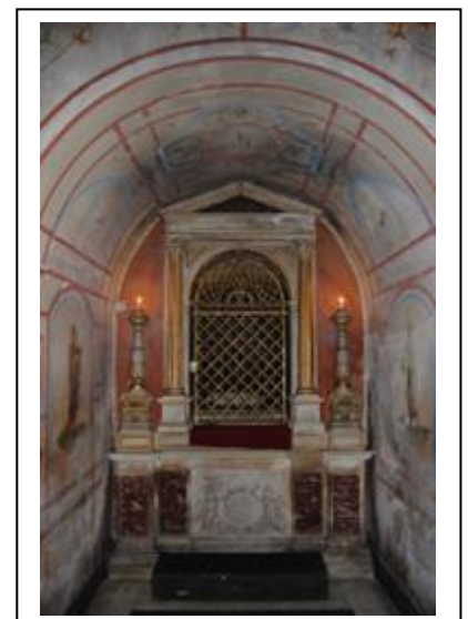
Shrine of Philip and James