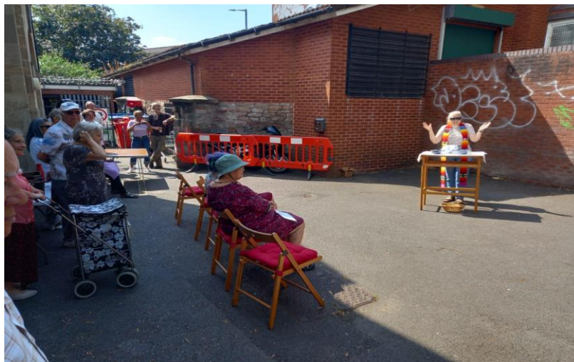
Eucharist in the yard, while serving those in need

Behind all the ministries that have been part of our life at "82", prayer has been the constant. Having a Sister who is a Priest has meant that we are now able to offer the Eucharist more often. Our regular service is at 1:30pm on Monday, Tuesday and Wednesday, each week our Foodbank is open - all are welcome. We have mirrored the early days of our presence by having a Eucharist in our yard - you'll see from the photo of our garden that we would have them in the garden on occasions.