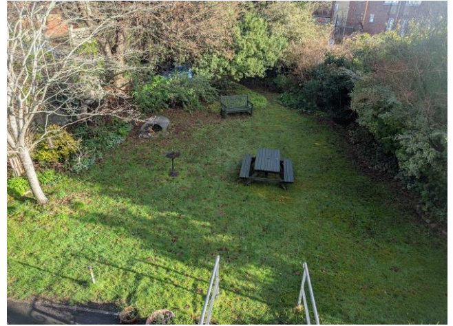
The Garden, then and now

Behind all the ministries that have been part of our life at "82", prayer has been the constant. Having a Sister who is a Priest has meant that we are now able to offer the Eucharist more often. Our regular service is at 1:30pm on Monday, Tuesday and Wednesday, each week our Foodbank is open - all are welcome. We have mirrored the early days of our presence by having a Eucharist in our yard - you'll see from the photo of our garden that we would have them in the garden on occasions.